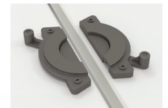
Optional Link Unlocked