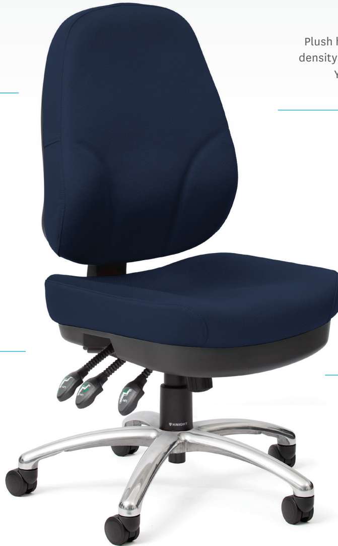
Covered in Breathe Navy

Heavy duty ALLOY BASE FOR EXTRA STRENGTH and stability.