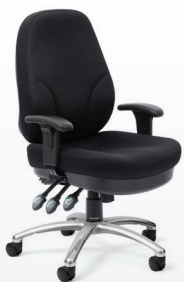
PLYMOUTH (HEAVY DUTY) OPTIONAL ARMS