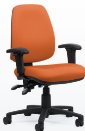
QUAD HIGHBACK OPTIONAL ARMS