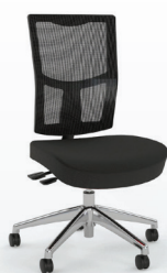
URBAN MESH ALLOY BASE