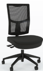
URBAN MESH NYLON BASE