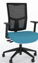
URBAN MESH OPTIONAL ARMS